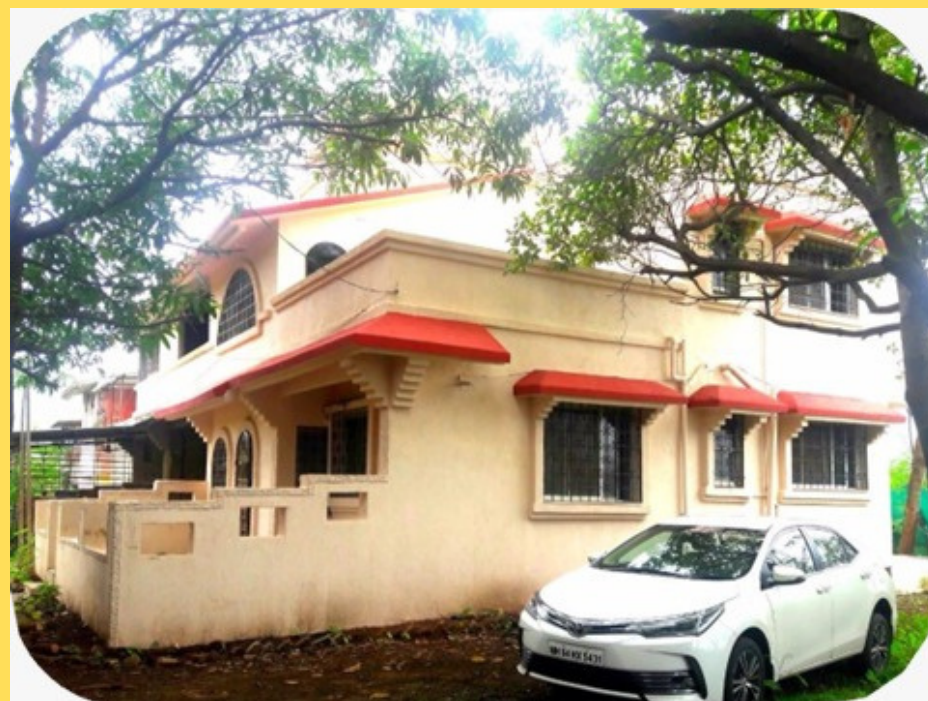
Shalom Niwas ,Our Girls Home

To give victims of exploitation the opportunity to live in freedom with dignity and equality in society through providing shelter, education, vocational training and moral and social counselling