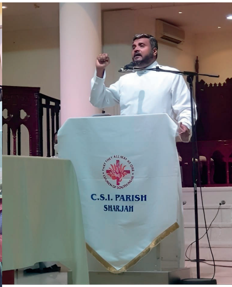
MISSIONARY'S SHARJAH VISIT