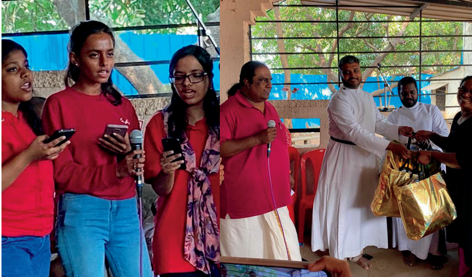
SHARING THE JOY OF CHRISTMAS