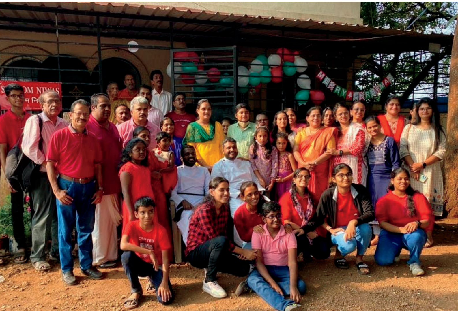
PANVEL WORSHIP CENTRE VISIT