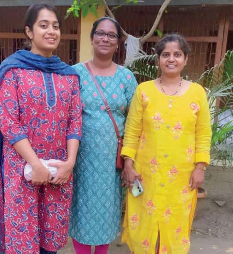
ASHA SADAN VISIT