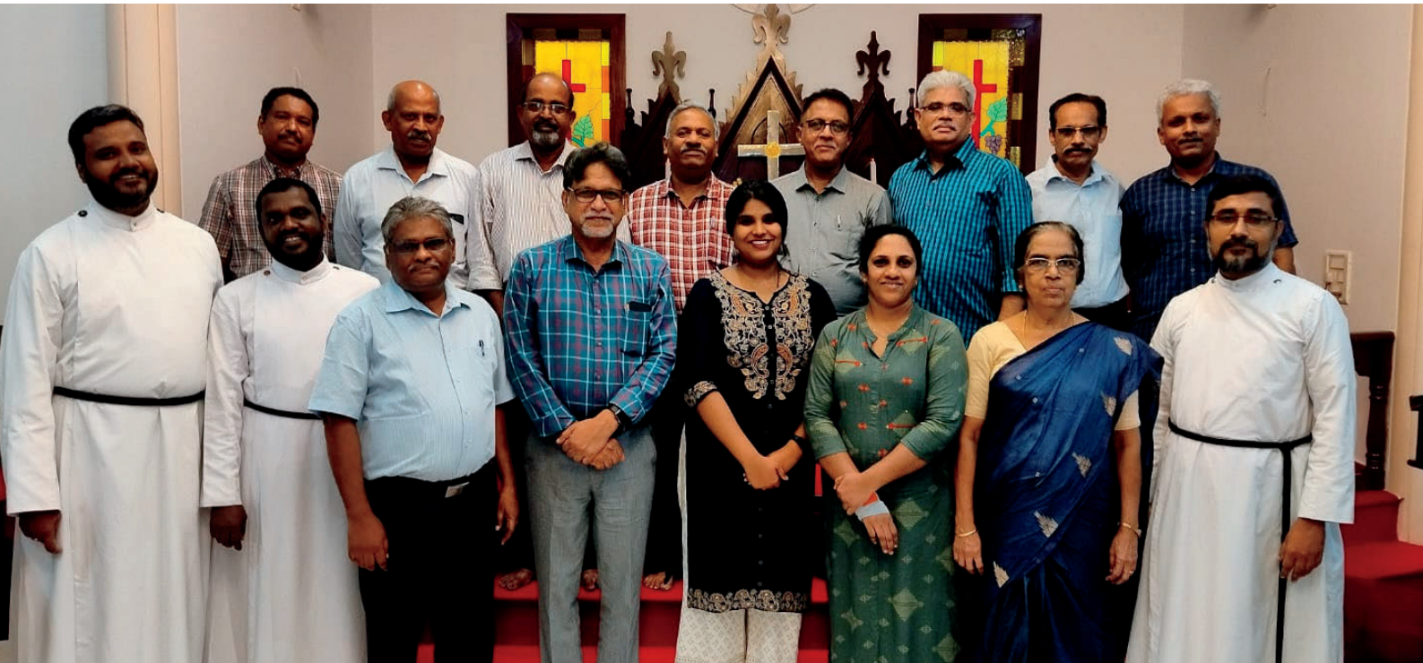
DELEGATES WITH IJM TEAM AFTER THE SHALOM MISSION OFFICE BEARERS RETREAT