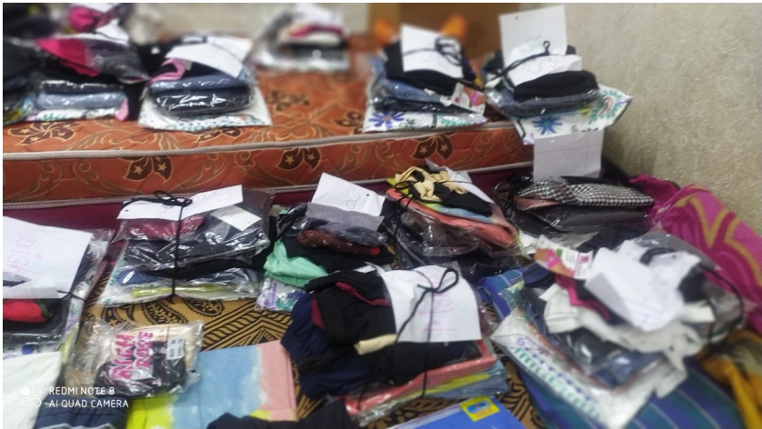
School Opening Gifts of Dress, Bag, etc