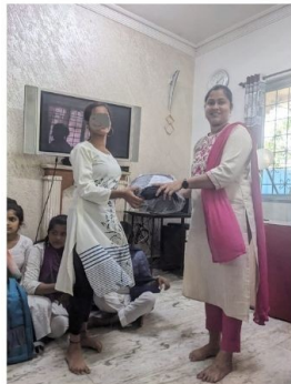
Dress & Bag Distribution