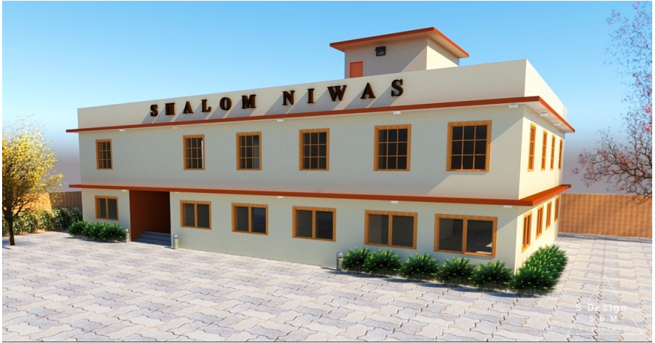
Our Proposed plan for New Building in Titwala