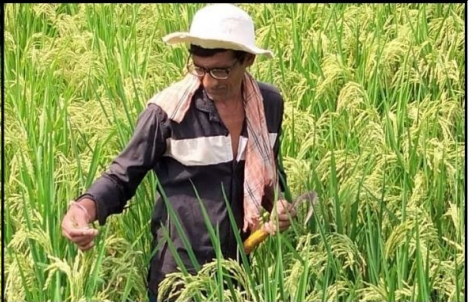
Titwala Vegetable farming